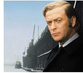
3. Get Carter