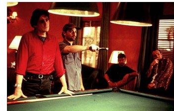
9. The Usual Suspects