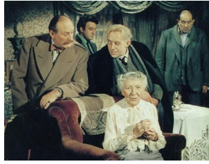
2. The Ladykillers