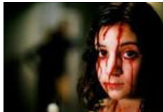
14. Let The Right One In