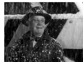
36. It's A Wonderful Life