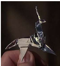
10. Blade Runner