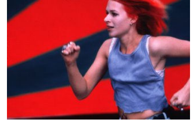
24. Run Lola Run