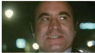
8. The Long Good Friday