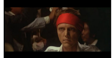
30. The Deer Hunter