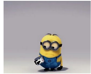
21. Despicable Me