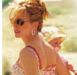
26. Erin Brockovich