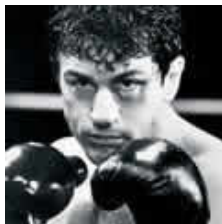
13. Raging Bull