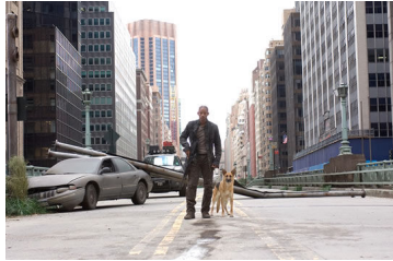
23. I Am Legend