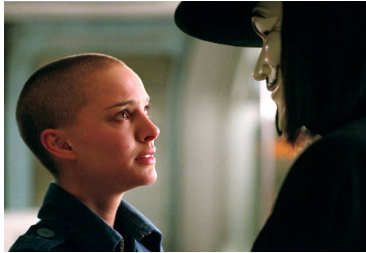
4. V for Vendetta