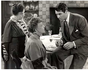
1. Arsenic and Old Lace