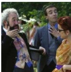
31. Four Weddings And A Funeral