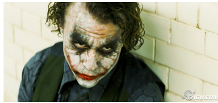
29. The Dark Knight