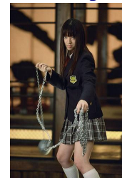
12. Kill Bill