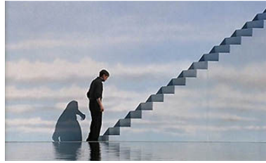
5. The Truman Show