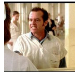
33. One Flew Over The Cuckoo's Nest