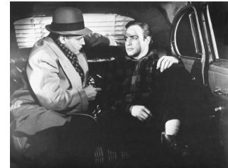
6. On The Waterfront