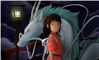
28. Spirited Away