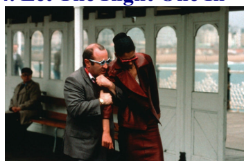
17. Mona Lisa