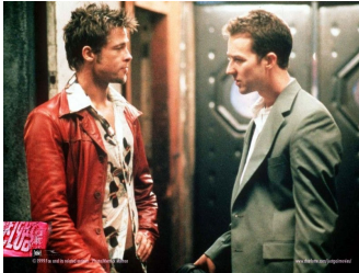
25. Fight Club