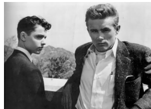
35. Rebel Without A Cause