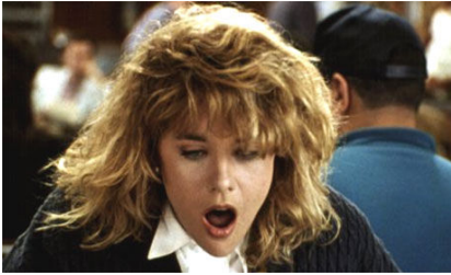
22. When Harry Met Sally