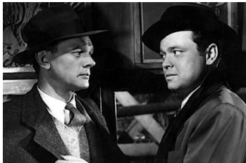
7. The Third Man