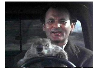
15. Groundhog Day