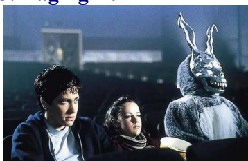
16. Donnie Darko