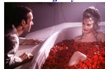
18. American Beauty